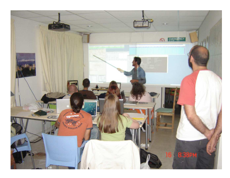
Figure 1: The "classroom" in the service building showing the tables and the projection screen

comfortably seat 3 persons each, and in front of this we have a large projection screen ( \sim 1.5 \text{m} \times 3 \text{m} ). During the night this screen is used to project a live copy of the display of the data acquisition computer being operated in the telescope control room.